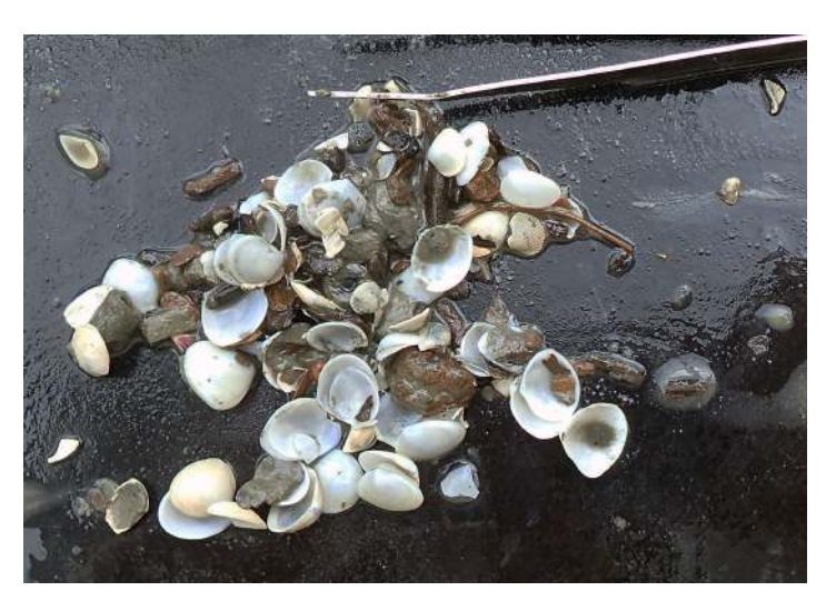
Figure 2. A representative molluscan death assemblage collected on the continental shelf offshore Cocodrie, Louisiana in 2016. Tweezers for scale.

For their individual research projects, participants also worked with samples collected offshore Alabama and Florida in 2015. These live-dead samples were collected by the Project Director, Franklin and Marshall College undergraduate students, and the staff at the Dauphin Island Sea Lab, Florida State University Coastal and Marine Laboratory, and Florida Institute of Oceanography. Collection protocols in 2015 were comparable to those in 2016 with the exception that a greater variety of benthic sampling equipment was employed (i.e., sediment grab samplers, box corers, and dredge) due to regional variation in substrates and equipment availability at each marine lab.